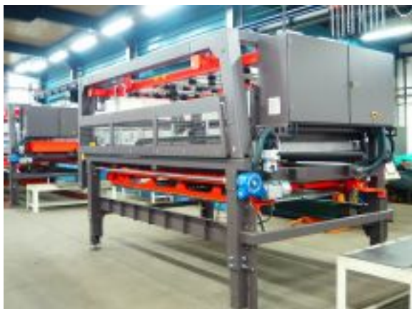
Bystronic ByTrans - assembled machine View image